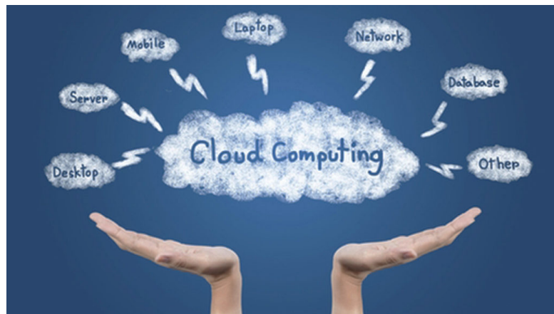
They key components of cloud technology will be used to provide a new level of service for GMHBA customers.